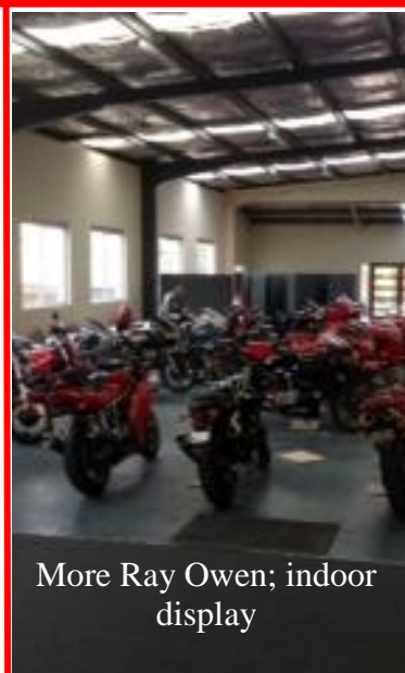
More Ray Owen; indoor display