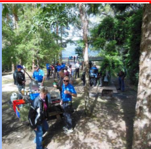
Just a few of the OTH pictures Dieter has uploaded to the club website - there are lots!