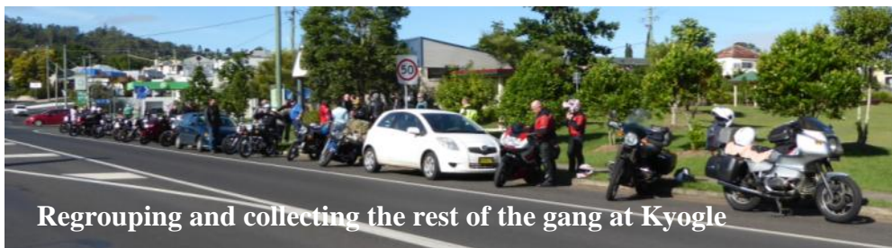
Regrouping and collecting the rest of the gang at Kyogle

Monday was another beautiful day in paradise which saw us heading for Goondiwindi, with Texas planned for morning tea. The road from Stanthorpe to Texas is a beauty, with a lot of variety. Variety of corners and variety of