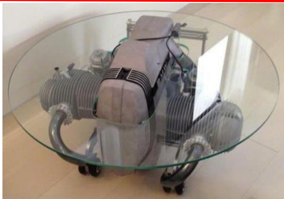
100 things to do with a dead BMW - Number one: Coffee table