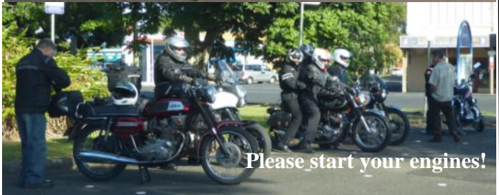
Please start your engines!