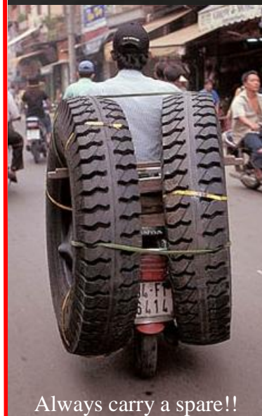
Always carry a spare!!