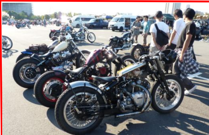
Seen by me at a Japanese Custom bike show in Tokyo 2013. Literally hundreds of bikes - mainly Harleys.