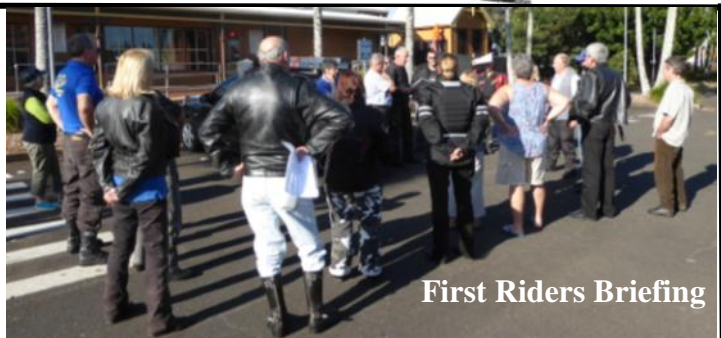
First Riders Briefing